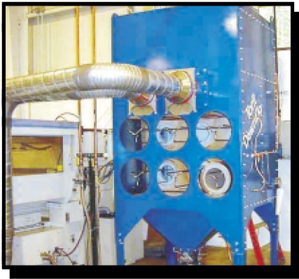
Image 1 - Full view of Dust Collector

Like all metal cutting machine processes, precision laser cutting machines produce waste (metal “dust”). Attached to many of these machines are Dust Collectors designed to pull the waste away through a cartridge filtering system (see Images 1 & 2). They use strong exhaust fans to create this “vacuum” removal system that pulls the waste away from the bottom of the machine. Since the cutting process involves metal and a laser, sparks are a natural byproduct. Occasionally, a spark from the cutting area flows into the Dust Collector. When this occurs, the metal “dust” can ignite. A fire can start slowly and smolder for some time inside the filters before becoming a flaming fire. As with all machines that are used to produce precision metal products, continual operation is a must for the plant productivity and profitability. So, a fire can be quite costly in the form of machine downtime.