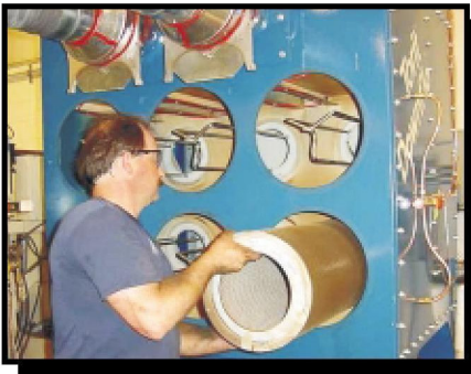
Image 2 - Filters installed on Dust Collector

Like all metal cutting machine processes, precision laser cutting machines produce waste (metal “dust”). Attached to many of these machines are Dust Collectors designed to pull the waste away through a cartridge filtering system (see Images 1 & 2). They use strong exhaust fans to create this “vacuum” removal system that pulls the waste away from the bottom of the machine. Since the cutting process involves metal and a laser, sparks are a natural byproduct. Occasionally, a spark from the cutting area flows into the Dust Collector. When this occurs, the metal “dust” can ignite. A fire can start slowly and smolder for some time inside the filters before becoming a flaming fire. As with all machines that are used to produce precision metal products, continual operation is a must for the plant productivity and profitability. So, a fire can be quite costly in the form of machine downtime.