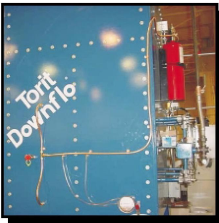
Image 3 - Installed Firetrace Indirect Low Pressure (ILP) Dry Chemical System

A Firetrace Indirect Low Pressure (ILP) system provides the perfect fire protection for these machines (see Image 3), since the customer specifically asked for fire protection in the filter compartment (They realize that Firetrace does not provide explosion protection .) The ILP system used 20 lbs. of Class D powder as the fire suppressing agent because of the metallic nature of the combustible dust. The Firetrace Detection Tubing was run above the collection cartridges to quickly detect a fire (see Image 4). Four Discharge Nozzles were placed throughout the Dust Collector to thoroughly saturate the area with powder upon system activation (see Image 5). A Pressure Switch was installed to shut the exhaust fans down as soon as the system detected a fire. It was also connected to the building’s fire alarm to signal the fire. A Manual release was included as well as a additional safety precaution (see Image 6).